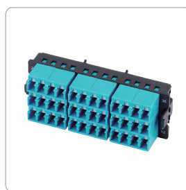
MM (OM3) LC/PC