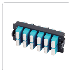
MM (OM3) LC/PC