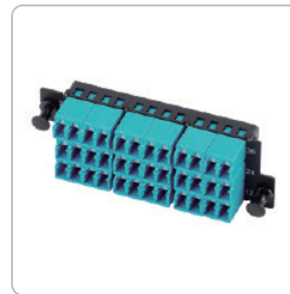
MM (OM3) LC/PC