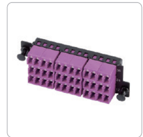
MM (OM4) LC/PC