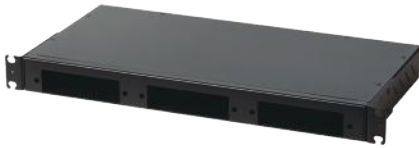
PSB PLC Splitter Fiber Optic Enclosure