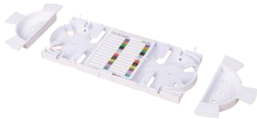
Fusion Splicing Kits (optional)

UltraX 1U enclosure is a rack mountable interconnect point specifically designed to manage dense fiber applications. This enclosure offers management of density up to 144 fibers. The detachable adapter plate on module cassette can be either installed independently and used along with fusion splicing kits. The detachable front cabling rack is designed with reliable hinge structure for friendly future maintenance.