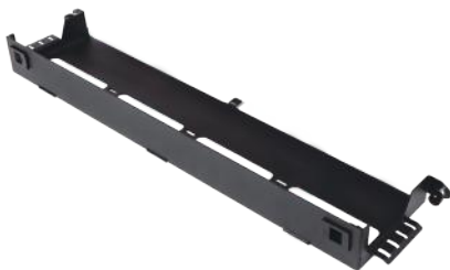
Front Cabling Rack (optional)